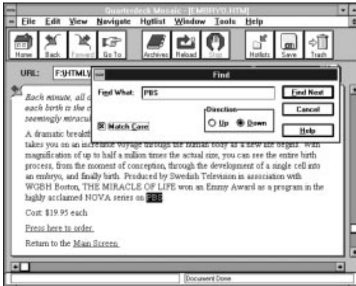
Figure 19: Find Dialog Box Used To Search for Text In a Document

Searches the current document for a particular string of characters. When you choose Find , a dialog box appears and you can enter search criteria.